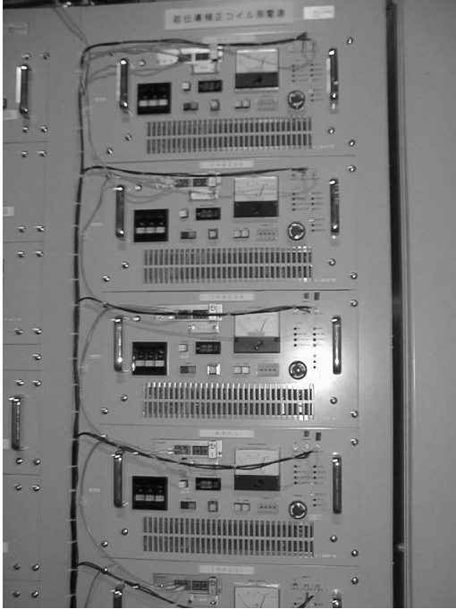
Fig. 3. PSICMs installed in QCS correction magnet power supplies.

magnet power supplies as shown in Fig. 3. In the figure, you can see PSICMs are installed in the magnet power supplies. QCS magnets are being tested now with PSICM in themselves. The steering magnet power supplies are now manufactured by a company.